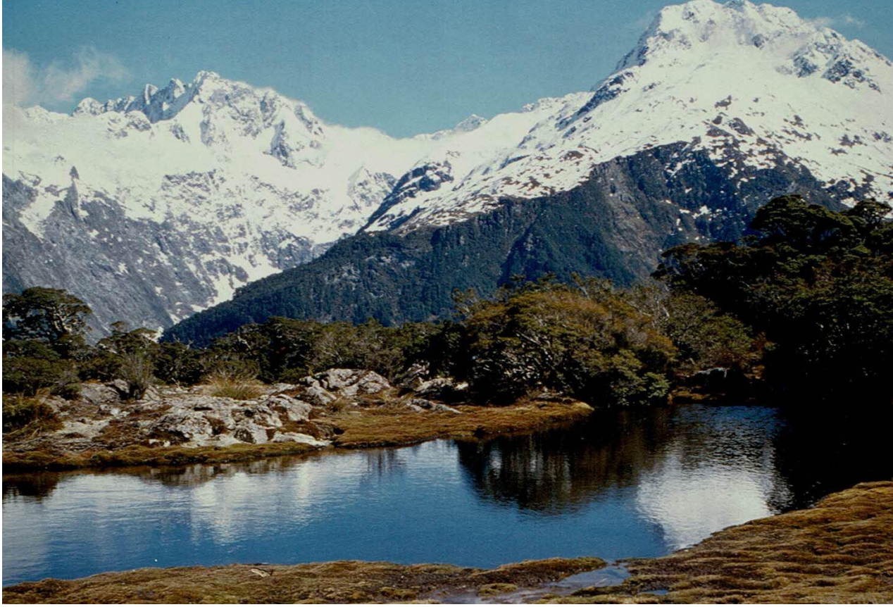
View from Key Summit