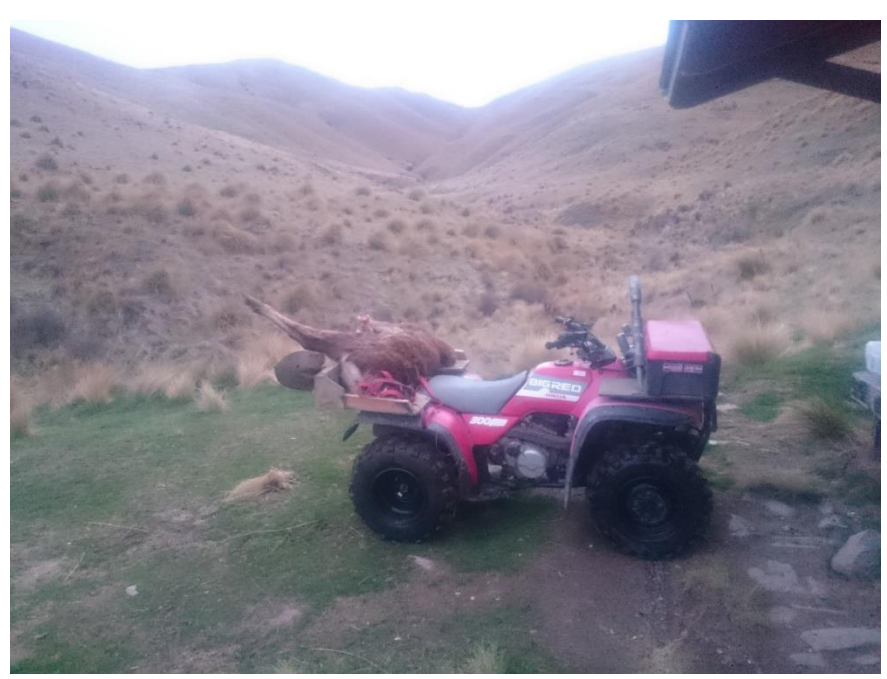
Old big red doing the business