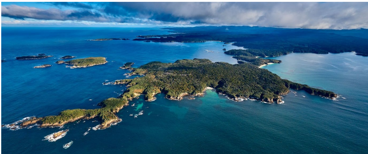
Rakiura, Stewart Island - Te Runanga o Ngāi Tahu

The long-held vision of restoring Rakiura as a haven for thriving native taonga is one step closer. Removing introduced predators will further enhance the mauri ora of Rakiura, supporting healthier people and the local economy.