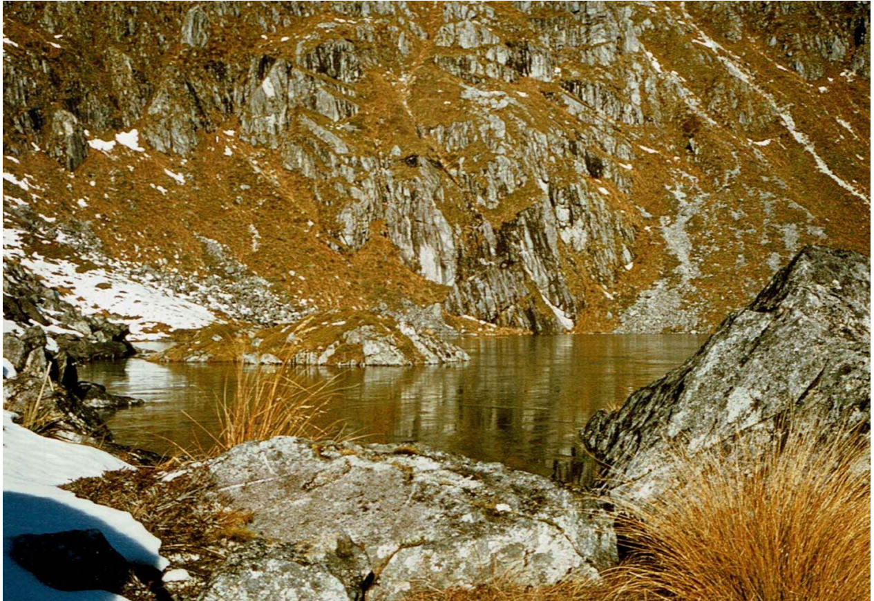
Tarn Victoria Range North Westland