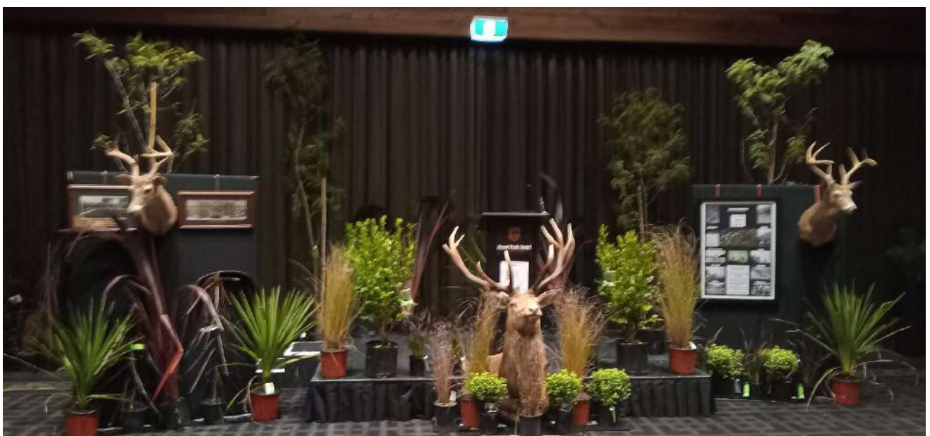
The set up opening night

A final thought on “social licence” CATS. The need to Kill up to 8 million wild cats were mentioned on TV1 Breakfast programme Monday after conference. Where they were interviewing a pest control operator who was using cage traps to be more humane, ( near civilisation). They suggested his need to kill those caught humanely, no details! How would those reporters and the cat lovers in the audience view the poisoning of cats!? (note poison not mentioned in the programme). But be aware we hunt & therefore kill. We don’t want to be the pot calling the kettle black.