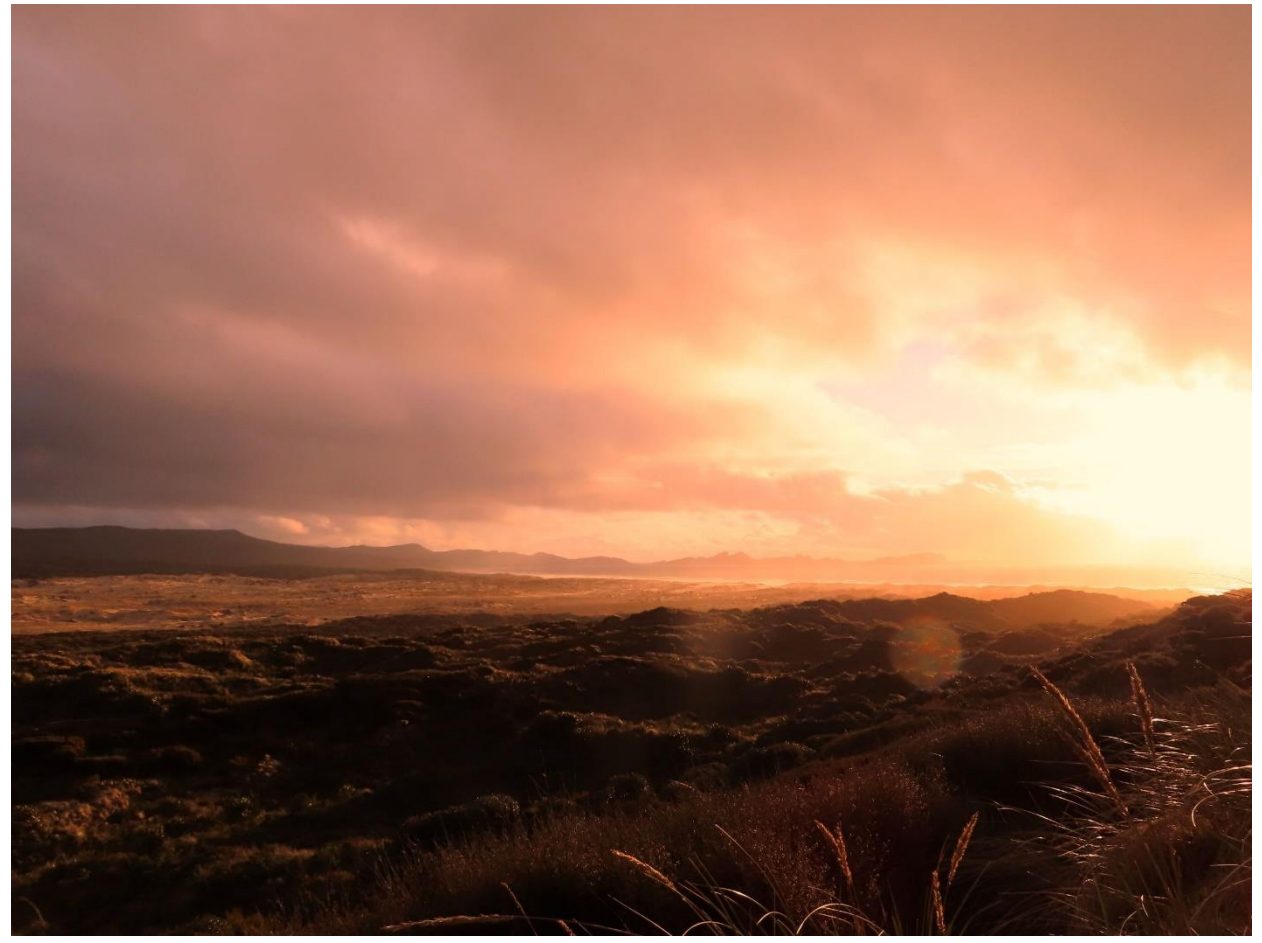
Mason Bay Sunset