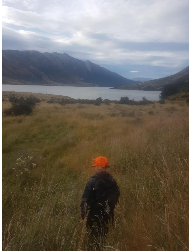
Mavora pre lock down one of my favour places to hunt ☐