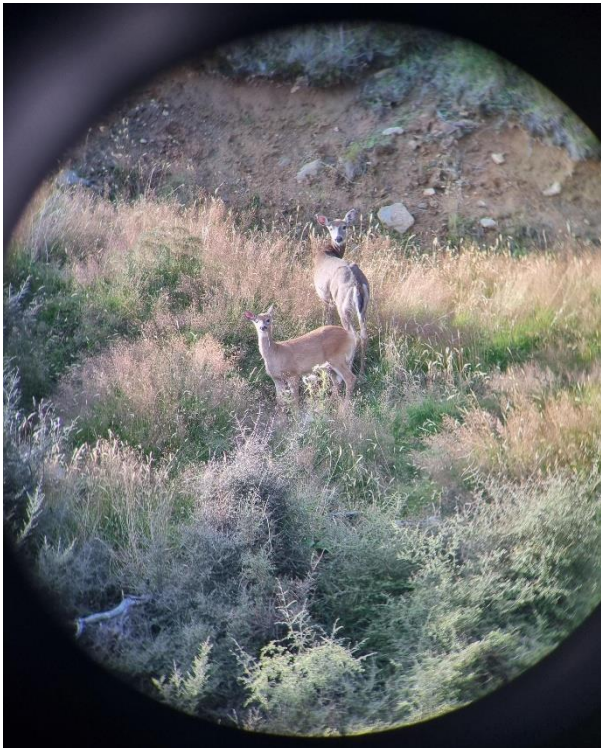
Whitetail Rees Valley