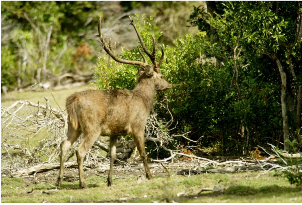
An acceptable stag making off to safety.