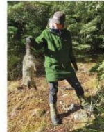
Liz, a keen conservationist, spent a morning setting trap lines around the hut which enabled some of our group to learn about pest control and help pluck possums.

end of the hunt, screaming more missions and asking "when's the next one?" I will definitely be planning more ladies' hunts and hope to get better at writing about them for future articles. I asked the ladies for some input/soundbites for this article and a few of them ended up writing short stories of their individual experiences which was bloody awesome. The first of them is included in this issue. "When's the next one?" NZDA