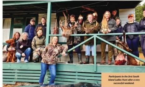
Participants in the first South Island Ladies Hunt after a very successful weekend.