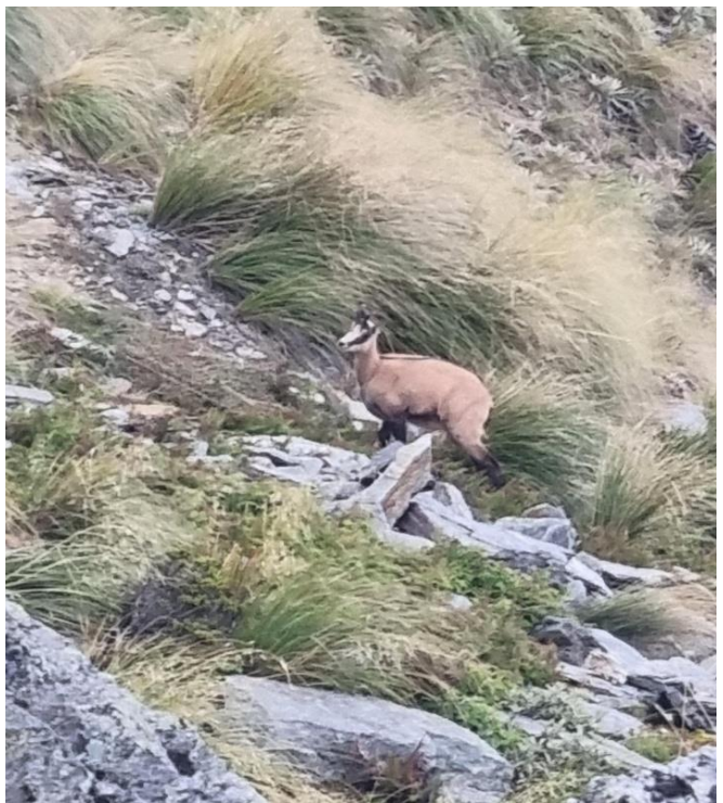
Young Chamois @ 20m

I hope everyone has had a chance to get out and about over the last month its prime time for hunting right now the Roar in full swing the rut and duck shooting coming up. I've been pretty lucky and snuck out more than normal in the last month chasing reds, chamois, fallow and soon to be out on the ducks. If you manage to down a decent specimen keep in mind the branch AHT competition is in May, we'll have the measuring day on the 12 th of May at the club rooms if your unable to make it get in touch your welcome to drop of to myself of one of the other committee members to take along on the day. Please make sure they are cleaned up. If you do want a head scored outside the AHT comp were more than happy to help just get in touch. I'm based just out of Edendale, and we have more than one in Invercargill area that can score heads for you.