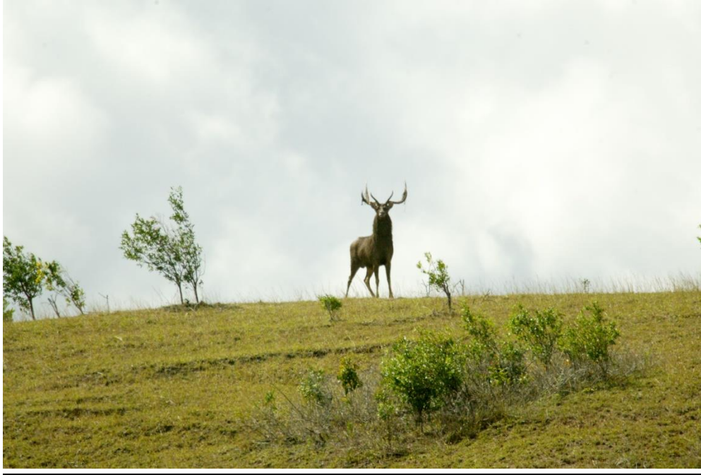
Busted, sometimes even Camo will not work.