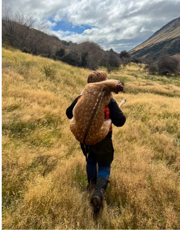
Frist Place Topical Luke Payne