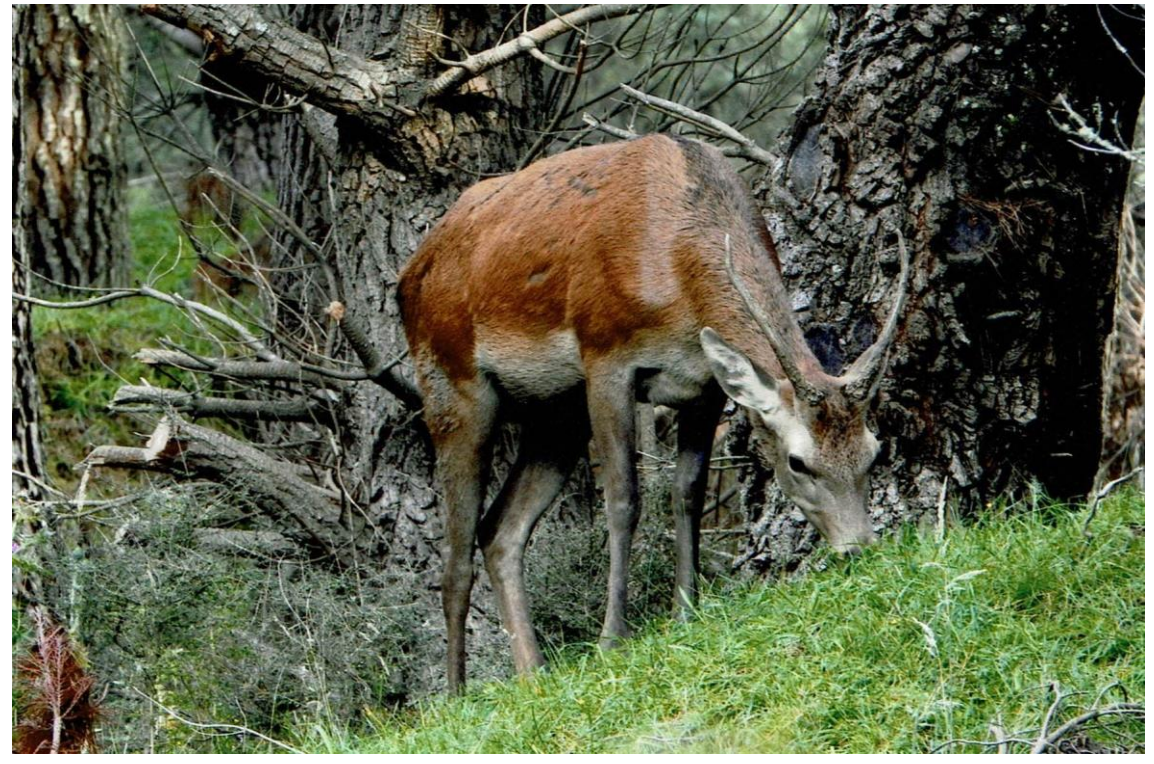
Frist Place Wildlife Luke Payne