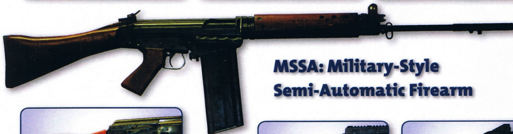
MSSA: Military-Style Semi-Automatic Firearm