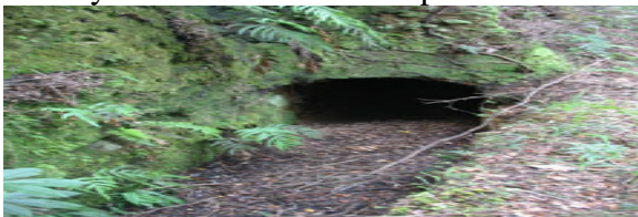
Port's Water Race today

Shortly after the success of the Otago rushes, gold was discovered in Southland, and miners flocked to the area. The southern goldfields at Nokomai, Waikaia, and in particular the Longwoods, were characterised by small yields over a sustained period.