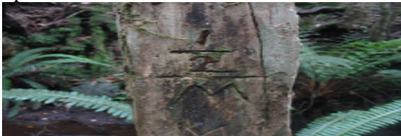
Port's Water Race Mile Post

Henry Horatio Port and Charles Arthur Port were two of the miners operating a claim on the eastern side of the range who sought to improve their water supply. They obtained a licence to construct an initial race of six miles from Gorge Creek to the current location of Printz Battery in 1877. In 1888 they were approached by Chinese miners to extend the race to their workings at Round Hill. Chinese miners were contracted to excavate the race extension and it was completed over a period of fourteen months. Martin's Race and Turnbull's Race were also constructed at this time to provide water to the gold mining operations at Round Hill.