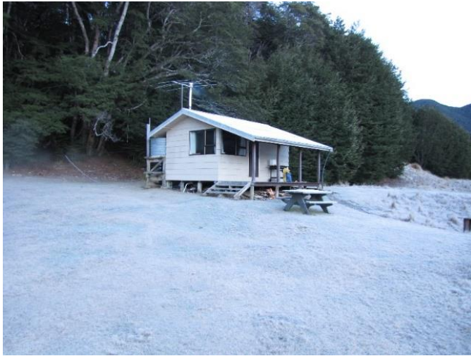
Red Stag lodge after a good frost

Bookings to Neville & Carol Miller Phone (03)216 8654