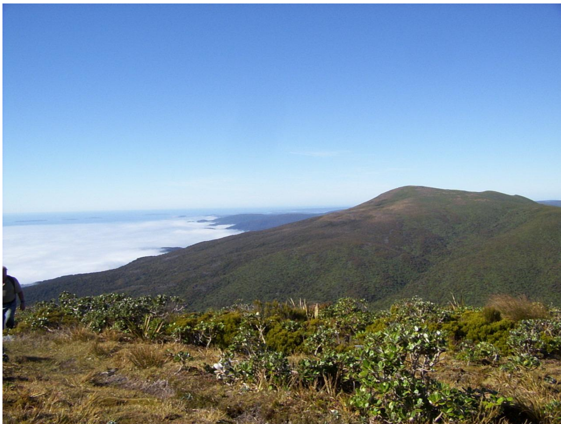
Looking down the East coast from Mt Anglem – Stewart Island