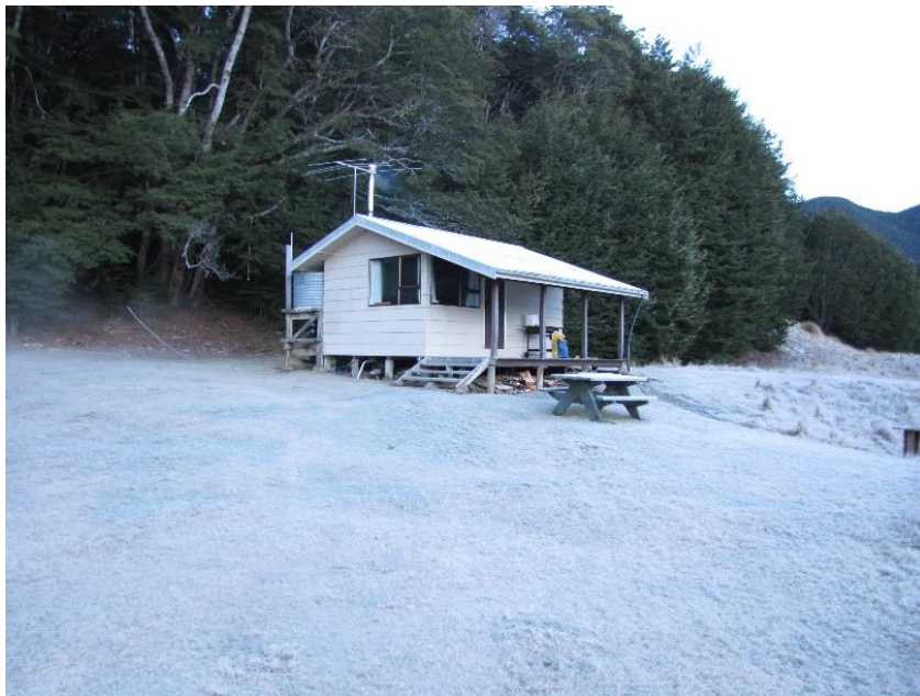
Red Stag lodge after a good frost

Bookings to Neville & Carol Miller Phone (03)216 8654