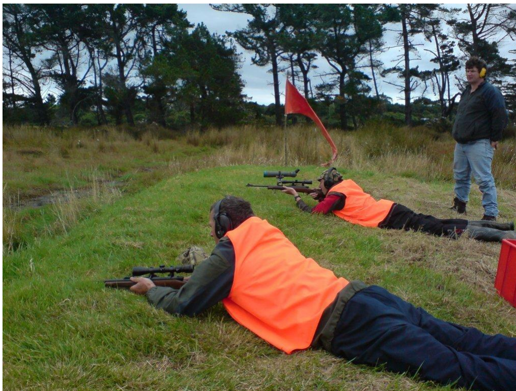
February's Club rifle shoot at the rifle range.

March 2011 Southland Branch NZ Deerstalkers Association