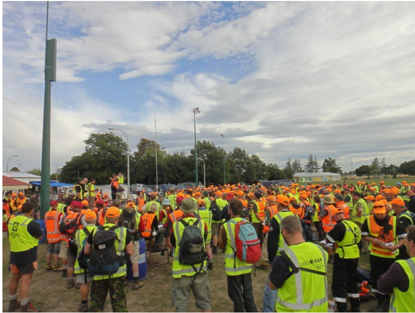
LandSAR members ranging from Stewart Island to Northland assisting in Operation West as part of the 2011 Christchurch Earthquake.