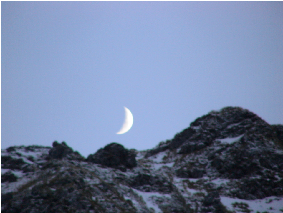
Moon over Adams Flat - West Coast Tahr Hunt

The robot then says, "What's your IQ?" The guy says, "Uh, about 50." The robot leans in real close and says, "So, you still shooting a ..270.....?"