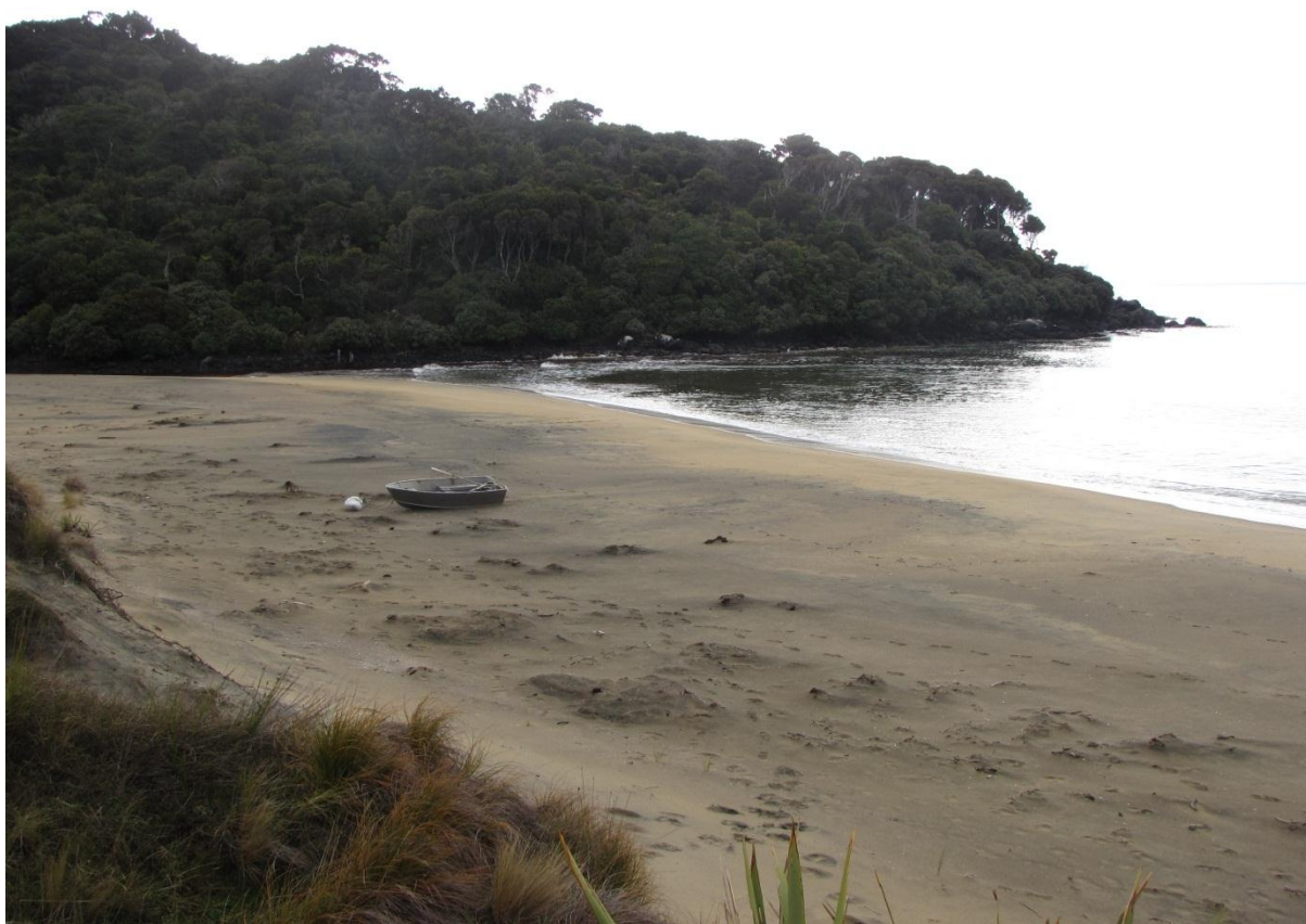
Murray's Beach – Stewart Island