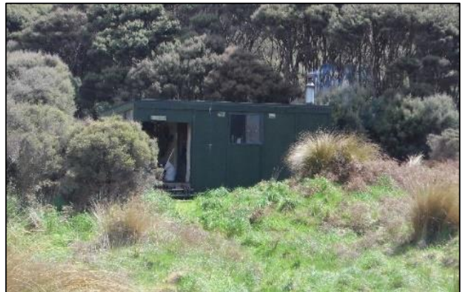
New Hunter Hut

The “new hunter hut” is a newish 4 bunk hut built in 2008 by the Rakiura Hunters Camp Trust to replace the old hut on the block. These huts are for hunters and cost $30 per person in the permitted hunting party. There is currently about 18 huts on the island. The old hut was a converted dark room from deer farming days at Island Hill. Farming at Island Hill had ceased about 1986 when the lease was surrendered to the crown. This new hut was built at the same time as an identical hut on the neighbouring Martins Creek block, where yours truly was one of the builders.