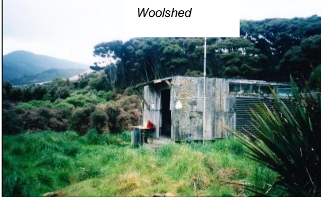
Old Hunter Hut