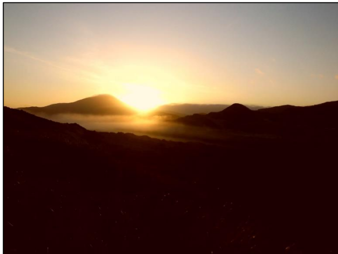
Sunrise over the Duck Creek

The following day, three of us finished off the last group of traps which were down and around both sides of Duck Creek. After this we largely had the next two days to ourselves to hunt and explore. This year as often can be the case this was limited by the weather. Some firewood was cut, the filter cleaned on the water tank, and I cleared a trap line of regrowth and replaced missing markers. Most of the serious hunting was done at first or last light - this got us out in time for some sunrises or sunsets.