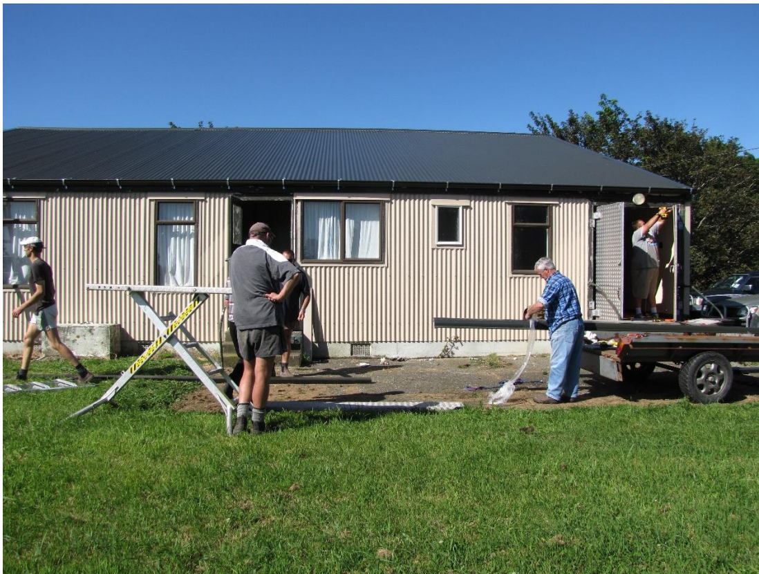
Working Bee in action

To be an active club the club needs active members.